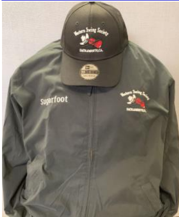
Jacket Front with Fitted Ball Cap